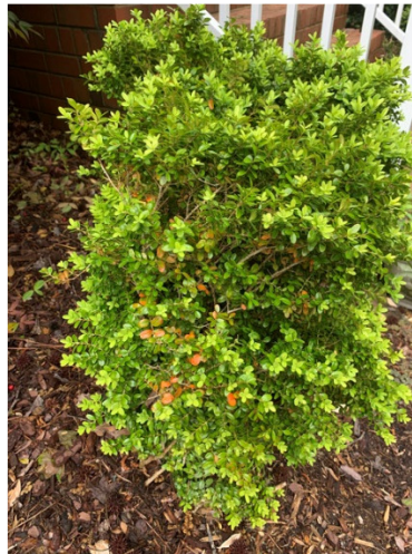
Overall image of the whole plant