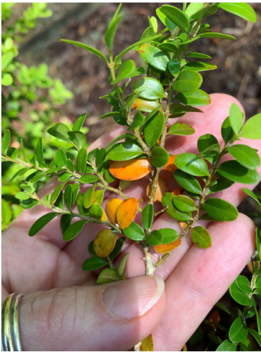
Well-focused close-up image