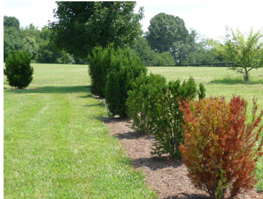
Pattern of the problem in the landscape