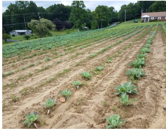
Pattern of the problem in the field