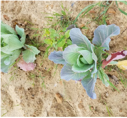
Overall image of the symptoms on the plant