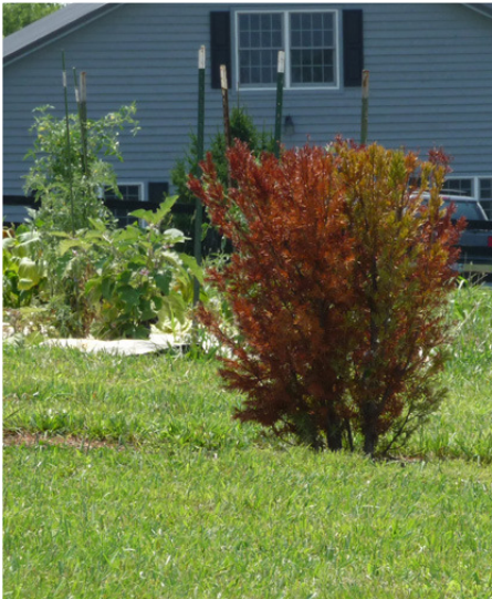
Overall image of the symptoms on the plant