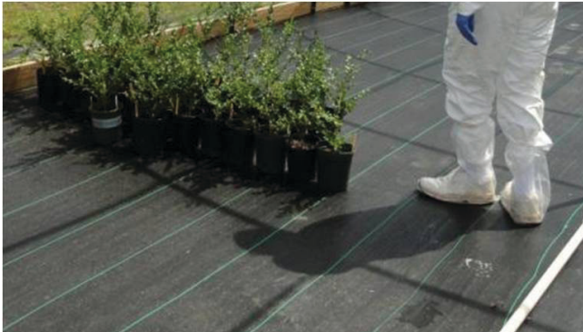
Figure 5. Store plants on easy-to-clean surface such as weed mat over well drained gravel.