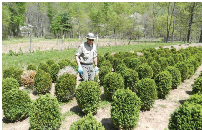
Figure 8. Scout host plants frequently.