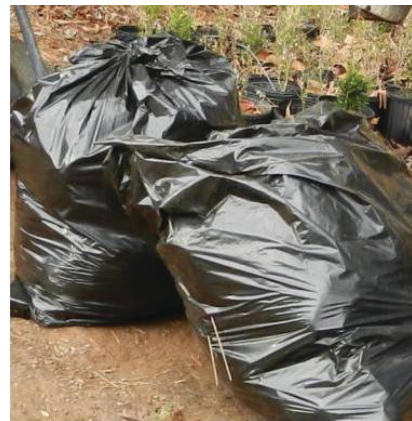
Figure 1. Infected plants should be bagged to contain leaf debris.

II. Suspend use of all fungicides during the quarantine period.