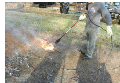
Figure 2. Residual leaf debris can be eradicated by burning with an agricultural flamer.