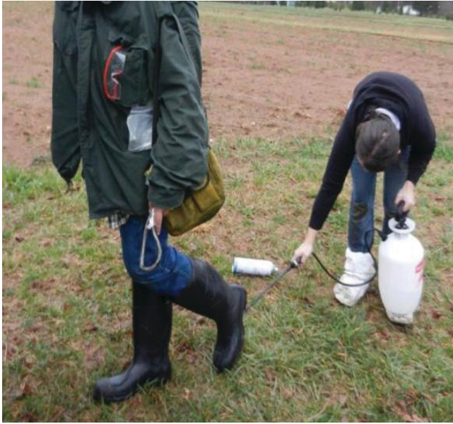
Figure 6. Clean and sanitize boots between hoop houses and production fields.