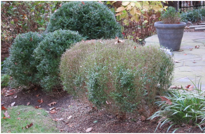
Fig. 2. Defoliation on boxwood in the planter and the mature plants in the foreground.