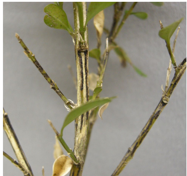
Fig. 3. Dark streaks on stems.