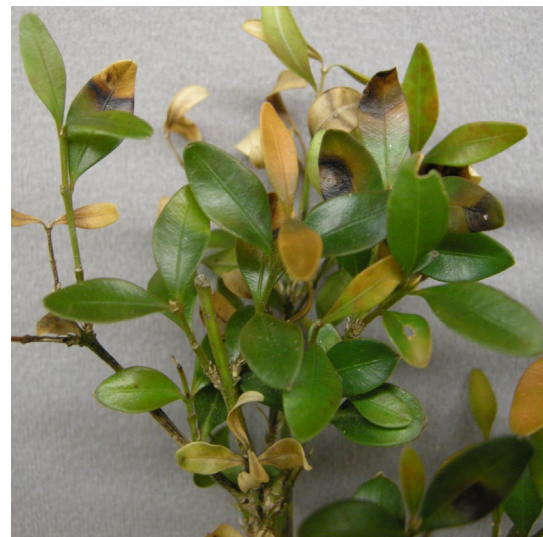
Figure 1. Leaf spots are typically circular and brown and develop a dark brown border (photo by M.A. Hansen).

The most characteristic symptoms of boxwood blight on susceptible boxwood cultivars are brown leaf spots (Fig. 1) that lead to defoliation (Fig. 2 on page 2) and black streaking on boxwood stem tissue (Fig. 3 on page 2). Some cultivars of boxwood can harbor the boxwood blight pathogen, yet show no symptoms; these cultivars are boxwood blight-resistant 1 (also referred to as “tolerant”) cultivars. Fungicides can also mask symptoms of the disease on susceptible cultivars.