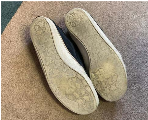
Figure 3. Shoes with minimal tread.

Always wear simple clothing when visiting a client's home. Nurses, volunteers, and care providers should wear solid-colored scrubs with minimal pockets and creases, and dark shoes with minimal tread (Figure 3). Social workers and chaplains visiting hospice patients should wear solid-colored shirts (no patterns) and khaki or black pants. Avoid shirts with buttons and pockets. Also avoid cargo pants (too many creases) and pants with cuffs. Do not accessorize (jewelry, watches, etc.) or bring in unnecessary handbags or backpacks.