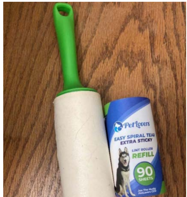
Figure 4. An extra-sticky lint roller. (Morgan Wilson, Department of Entomology)