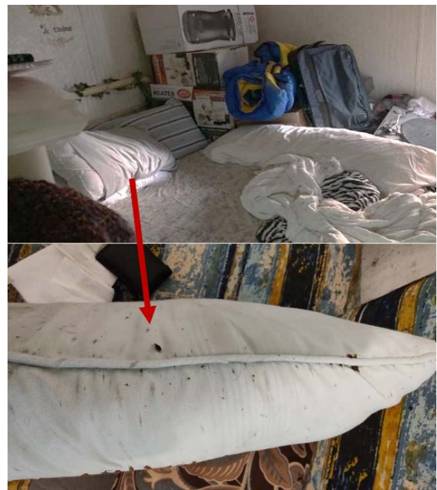
Figure 1. A closeup of a bed bug infested pillow in a client's bed.

one or a few bed bugs are introduced into a low-income client's home, it is very likely that a full-blown infestation will develop over time (Figure 1).