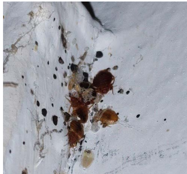
Figure 2. Bed bug adults, nymphs, eggs, and fecal spots. (Dini Miller, Department of Entomology)

However, even if you have not yet received any bed bug training, it is imperative that you are able to visually identify bed bugs (Figure 2). An adult bed bug is typically described as being "the size (5-7 mm) and color of an apple seed." Immature bed bugs (nymphs) vary in size (1.5-4.5 mm) depending on their life stage, but they are smaller than the adults and range in color from whitish to yellowish brown. Although nymphs are not as visibly obvious as the adults, even the youngest first instar nymphs can be seen with the naked eye when they are moving. Unfortunately, bed bug nymphs are good at hiding and will often be concealed in small cracks and crevices. If you do not see the bugs themselves, be sure to look for dark fecal stains on surfaces, as well as the white eggs and shed skins.