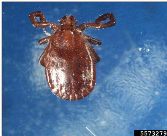
Figure 1. Adult Asian longhorned tick.

The Asian longhorn tick (ALT; Haemaphysalis longicornis Neumann) is an invasive species of hard tick in the family Ixodidae (Fig. 1). This tick was not known to be present in the US until it was found on a sheep in NJ in 2017, but a review of collections tick specimens revealed that ALT has been present since at least 2010. By January 2023, ALT has been found in 17 states in the eastern US. To date, 38 counties in Virginia have established populations of ALT.