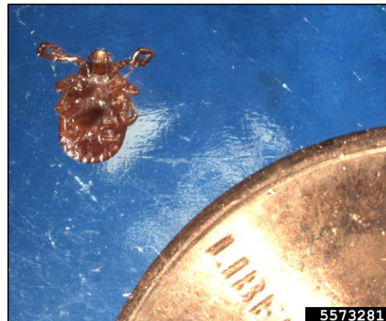
Figure 2. Adult Asian longhorned tick with penny for scale.

approximately the size of a pea. ALT is reddish-brown in color without any distinctive markings as immatures and adults (Fig. 1). The mouthparts are both short and broad (Fig. 3) in contrast to the long, narrow mouthparts of many common species of hard ticks in Virginia.