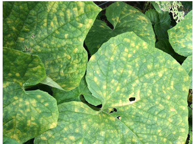
Figure 2. A fungal disease, downy mildew, on cucumber.

Watering. Water in the morning so plants have time to dry before the cool evening when fungal infection (fig. 2) is most likely. For plants susceptible to fungal infections, such as tomatoes, leave extra space between plants to allow good air flow and orient rows so that prevailing winds will help foliage dry quickly after a rain or watering. While this may reduce the number of plants per square foot, yields may still be higher due to reduced disease problems. To prevent spread of diseases, stay out of the garden when the plants are wet with rain or dew. Tip: use drip irrigation to prevent foliage from getting wet when watered.