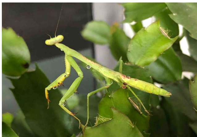
Figure 3. Praying mantis, adult.

Take advantage of the biological controls already taking place in your garden by encouraging natural predators such as praying mantises (fig. 3), ladybugs, lacewings, ground beetles, and others. Purchased natural predators are often effective for only a short period, however, since they tend not to remain in the place where they are put. Research the likes and dislikes of these natural predators as to what they prefer to eat and what habitat they need, etc. Provide these conditions where possible. Some beneficial insect suppliers now offer a formulation for feeding/attracting the beneficials to keep them in the garden longer.