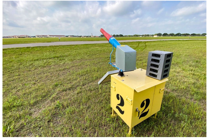
Figure 4. A propane cannon deployed in the field to deter geese from congregating or foraging.

Auditory scare devices are designed to make loud noises that frighten geese. One example is the propane cannon (fig. 4), a device that makes a loud blast, but does not fire a projectile. Under ideal conditions, strategically placing one cannon per every 2 acres may reduce goose depredation in crop fields to a tolerable level. Many newer cannon models have incorporated features to increase their effectiveness; these features include variable-timed detonators, which make the device fire in a random, unpredictable fashion, and mechanisms that automatically rotate the cannon's direction-of-projection following each blast. Relocate stationary noisemakers, such as propane cannons, to a different spot in a field every two to three days to prevent the geese from becoming habituated to them.