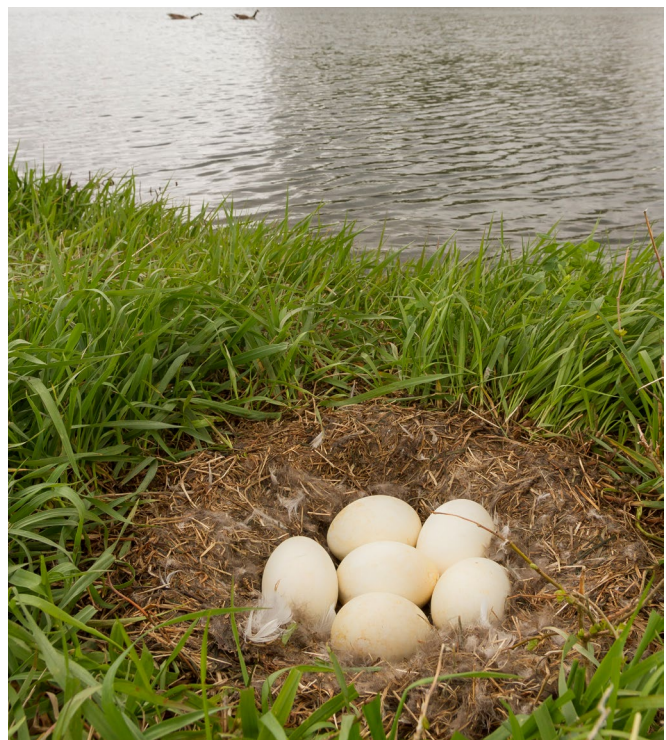
Figure 2. The nest and eggs of a mated pair of Canada geese.

Although Canada geese reach sexual maturity at age 2, they usually don’t breed before age 3. Males and females form lifelong pair bonds, but should one member of the pair perish, the surviving individual will select a new mate. Pairs usually return to the same nesting site year after year. Each mated pair will construct a bowl-shaped nest approximately 1½ feet in diameter. The pair uses vegetation such as reeds, grasses, and leaves to build the nest, lining it with down feathers plucked from the female’s breast (fig. 2). Nests are typically within 150 feet of water, often beneath shrubs or small trees or on raised patches of wetland vegetation. Where suitable nest sites are not abundant or where predation risk along the shoreline is high, geese also will make use of artificial nest platforms constructed no more than 1 foot above the water in ponds. Pairs sometimes will nest within 10 feet of each other, but to avoid attracting predators, they usually space themselves farther apart to reduce the concentration of nests in an area. Both the male and female will defend the nest site aggressively until all eggs are laid, at which point the male continues to defend the nest while the female incubates the eggs. If a predator or human destroys the nest or eggs during the early egg-laying period, the pair may produce a second clutch of eggs. However, they will raise only a single brood each year.