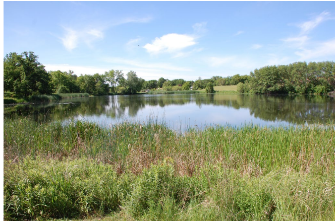
Figure 3. An example of a heavily vegetated natural barrier along the shoreline that can deter geese from accessing preferred grassy foraging area. This barrier was installed as part of a restoration project at Thompson Lake, Dakota County, Minnesota.

To make it difficult for geese to make their way toward food sources and to detect the presence of potential predators or other hazards, establish a zone of dense vegetation beyond the water's edge. Simply ceasing to mow a 20- to 25-foot-wide swath of vegetation just inland from the water's edge will allow a strip of thick, impenetrable vegetation to develop; this vegetation will restrict the ability of geese to move freely from the water into a foraging site (fig. 3). It also will interfere with a goose's visual line of sight from the water into the foraging area, making the goose more wary.