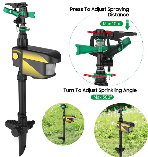
Figure 8. Example of a motion-activated water-spray device used to deter wildlife.

Devices that use pressurized water sprayers and motion detection technology to deter geese from entering a property are available commercially. When a garden hose is attached to such a device, a motion detector will cause the device to spray water toward animals it senses (fig. 8). The device automatically shuts off when no further motion is detected for a few moments. To establish a potentially effective line of defense, place several of these devices along the normal lanes geese use when walking from the water to their landward feeding area. Be sure to set the trajectory of the pressurized water stream at the proper height so the spray doesn't go over an approaching goose's head rather than into the face and upper body.