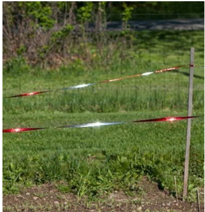
Figure 6. Mylar tape suspended above field crops from support posts to reduce bird depredation.