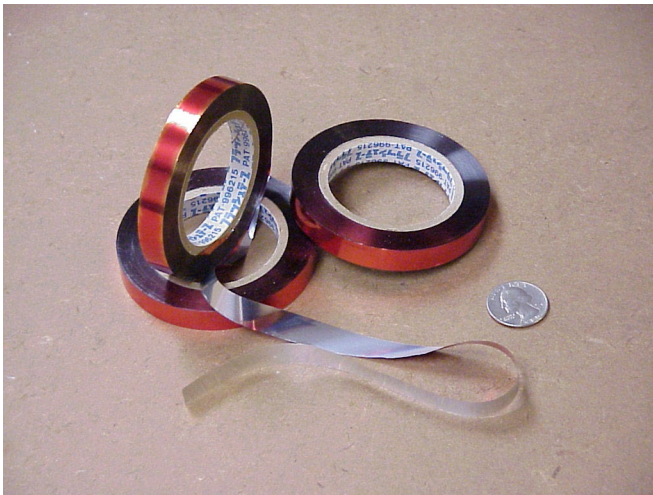
Figure 5. Mylar reflective tape used to deter birds.

If used persistently, physical harassment, or hazing, of geese sometimes can provide longer-lasting deterrence than inanimate stationary visual objects. Examples of hazing include using radio-controlled toys, herding dogs, and water-spray devices. Although more labor intensive and expensive to implement than visual or auditory deterrents, radio-controlled toy aircraft or boats present a greater perceived threat to geese. Model aircraft can fly over or chase groups of geese on land or water, and model boats can herd geese away from water. With both approaches, exercise proper care to avoid hitting or injuring the birds.