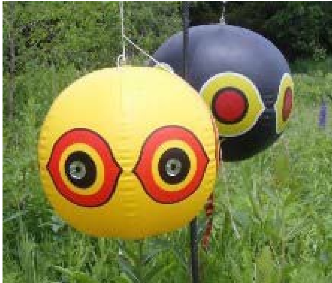
Figure 7. An eye-spot balloon deployed as a deterrent to ward off foraging birds.

Dogs, especially border collies, can be trained to chase and harass geese. However, geese continue to monitor favorite foraging and loafing sites, and, as soon as dogs leave the area and the threat of harassment no longer exists, the geese simply return. Even with persistent and repeated harassment, using dogs to drive geese away from highly preferred sites is rarely completely effective, especially in those areas where supplemental feeding occurs. For homeowners with water features on their property, the family dog may offer some protection against geese, but owners must remember that, in many communities, local leash laws apply — the dog cannot be allowed to venture off the property unattended. Additionally, it is illegal to allow a dog to catch or harm a goose. Dogs should be leashed or prevented from chasing geese during the time of the summer molt when these birds are flightless.